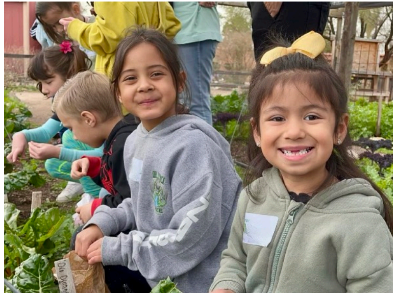
First Graders at their trip to the farm! More photos in the second newsletter later this week.

Thank you to all of our volunteers for the field trip! Please note, when chaperoning a field trip (especially this one), you are responsible for the students that are assigned to your group. Since the Kino Rock and Gem Show is an open-air bazar, it is important that you keep close tabs on all the kids in your care. Since the school has contracted a bus for the trip, parents can drive their own children, but we will be requiring the children in the chaperone's group to take the bus. This limits any personal liability our volunteers may have if they get in a fender bender. We also encourage chaperones to take the bus with us if they want. Save gas and spend more time with the kiddos!